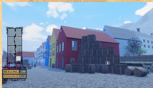
Through a hole in the crates near Bryggen