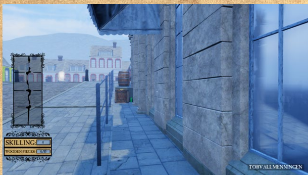
Near Ellingsen store close to Torvallmenningen