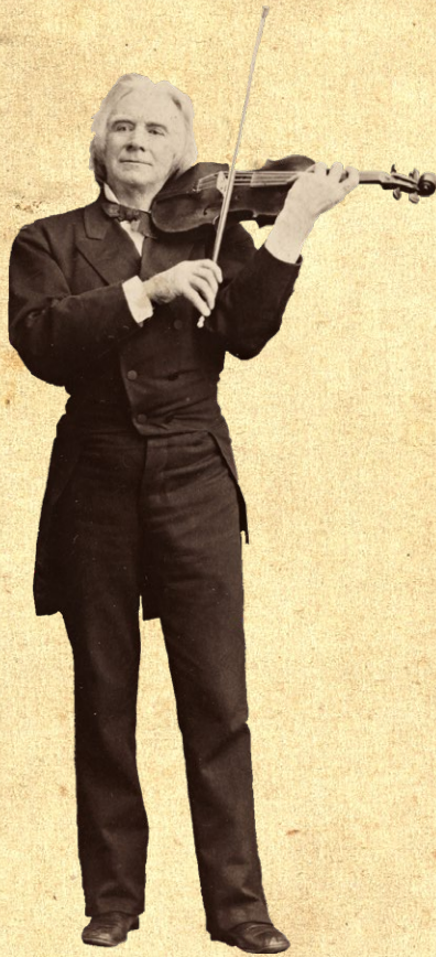
OLE BULL 1810 - 1880